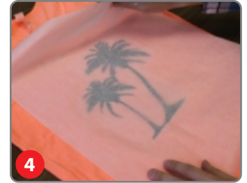
4 Cover with a cover sheet