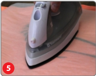
5 Use FIRM pressure for 10 seconds Cover entire image. Do not slide iron