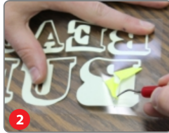
2 Weed (pick)