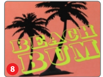
8 Wait at least 24 hours before first wash