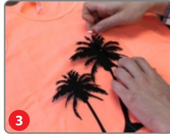
3 Place transfer on the garment as desired