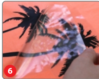
6 Remove the clear carrier