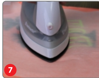
7 Cover and reheat for another 5-10 seconds